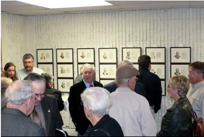
The Gallery of 20 sketches and biographies is located at the Kemptville Campus of the University of Guelph.